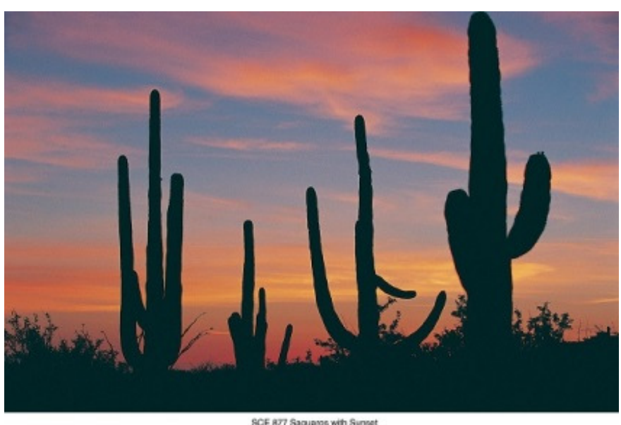
SCE 877 Sagueros with Sunset