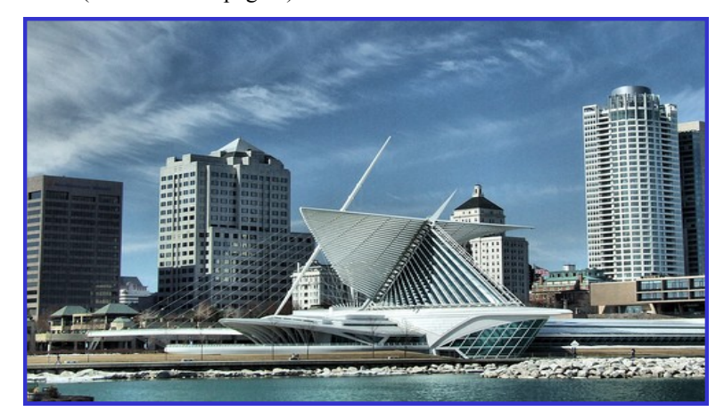
View of Quadracci Pavilion at the Milwaukee Art Museum