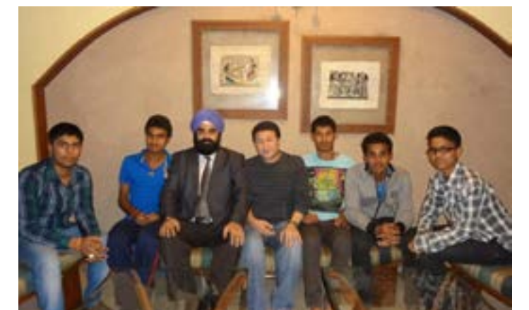
St. Anthony's School Kurseong with Principal and students for ILA cause

SEE PAGE 5 FOR MORE GREAT PHOTOS FROM INDIA