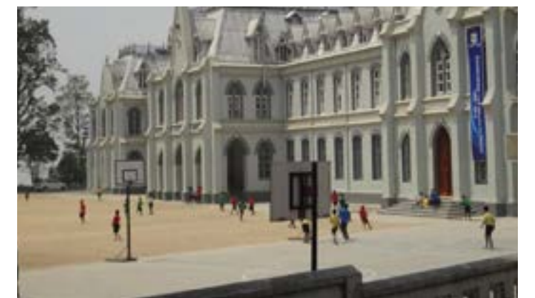
St. Joseph's School, North Point Darjeeling. Met the school Principal and discussed about listening and ILA